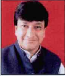
HAROON YUSUF MINISTER (FOOD & SUPPLIES AND INDUSTRIES)