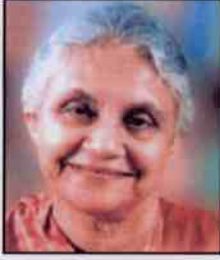
SHEILA DIKSHIT CHIEF MINISTER